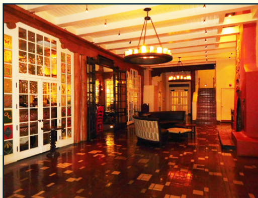
The La Fonda

We started out meeting at the only Santa Fe hotel that is located on the Plaza, La Fonda. The first inn on that site was built when Santa Fe was settled in 1607, so you know with over 400 years of humans living, loving, fighting and dying on this spot, there's bound to be a ghost, right? The current building that you see was built in 1922, and is filled with all the splendor of that age. What used to be a courtyard is now the main dining room, and it is here that you can possibly encounter the ghost of a man who lost his company's money