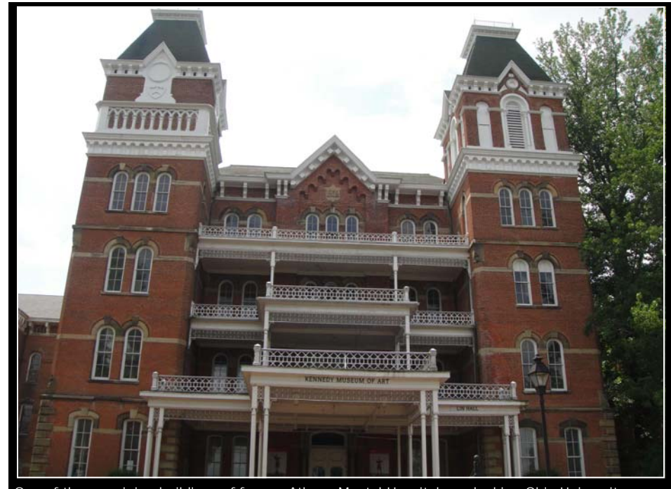
One of the remaining buildings of former Athens Mental Hospital overlooking Ohio University