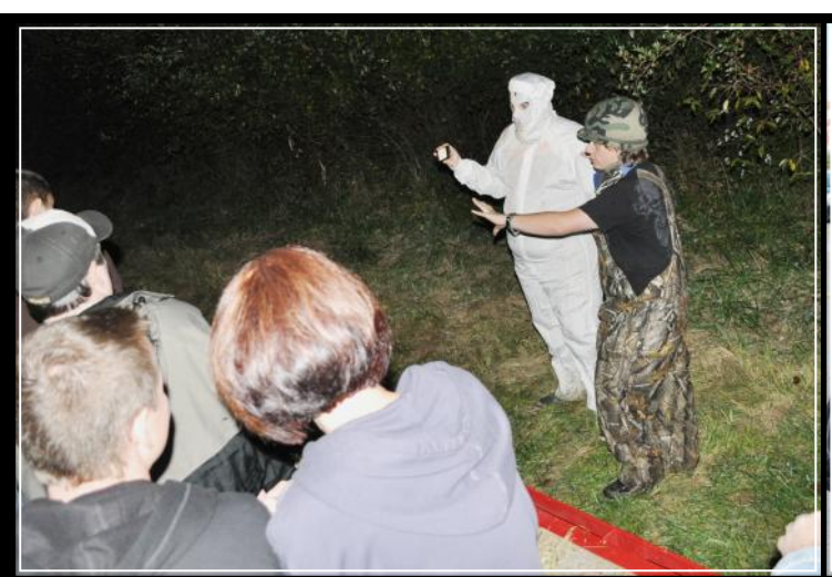
Local government officials conduct a scan to determine if our tractor was radioactively contaminated before granting us access to the TNT area.