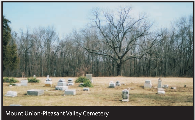
Mount Union-Pleasant Valley Cemetery

seen over the years that have appeared to have been touched/pushed/generally moved by a ghost, the heaviest thing I've encountered is a water glass, filled about halfway up. In other words, a ghost is really going to have to exert a lot of energy to be able to try and lift an entire tombstone. And we are talking "lift" here as there have never been any reports of drag marks being