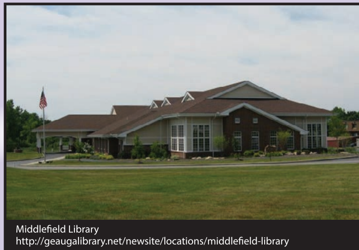
Middlefield Library http://geaugalibrary.net/newsite/locations/middlefield-library