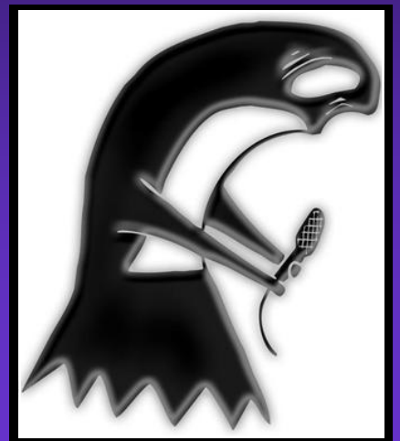
What does the future hold for Ghostly Talk Radio? Turn to Page 3 for details.

The Ghosts Give Back! Find out more about this year's charity drive on Page 2.