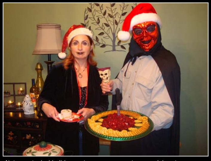
Not your typical holiday party, as some guests wore elaborate costumes and delivered frightening delicacies.

The evening carried on with great conversations and games with the Ghosts members. All who attended left with a great appreciation for all we have accomplished over the last 10 years and with a sense of anticipation and excitement for the next 10 years to come. Happy Holidays!