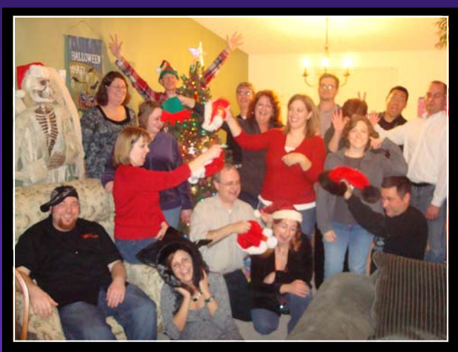
The Ghosts of Ohio rarely miss an opportunity to cut loose, and this year's "family" portrait was no exception.