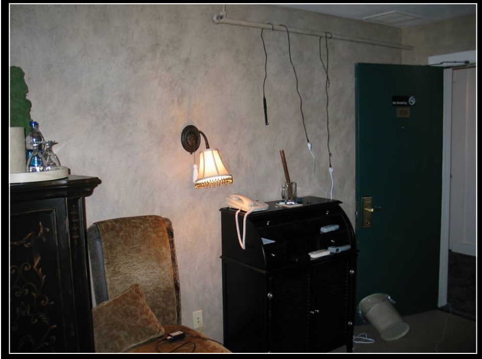
KAPoS sensors deployed at an investigation of Room 108 at the Versailles Inn in Versailles, OH.

drain in its energy. A recurring theme of strong paranormal activity, the rapid draining of batteries may signify the presence of a powerful ghostly manifestation, so this would be a cool new addition to KAPoS capability!