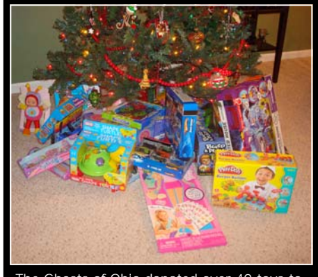
The Ghosts of Ohio donated over 40 toys to children in need at this year's party.

into broadening our scope of toy donations for 2010. Of course, we'll also be looking into ways that The Ghosts can reward you for your generosity, too!